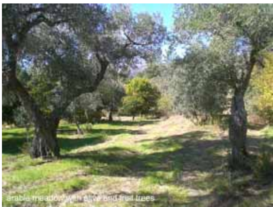
arable meadow with olive and fruit trees