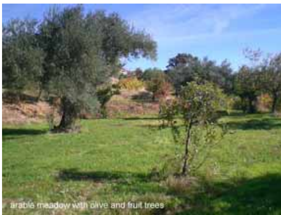
arable meadow with olive and fruit trees