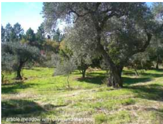
arable meadow with olives and fruit trees