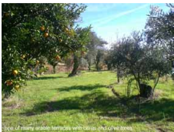
type of many orange tangerine trees with olive trees