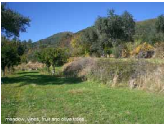
meadow, vines, fruit and olive trees