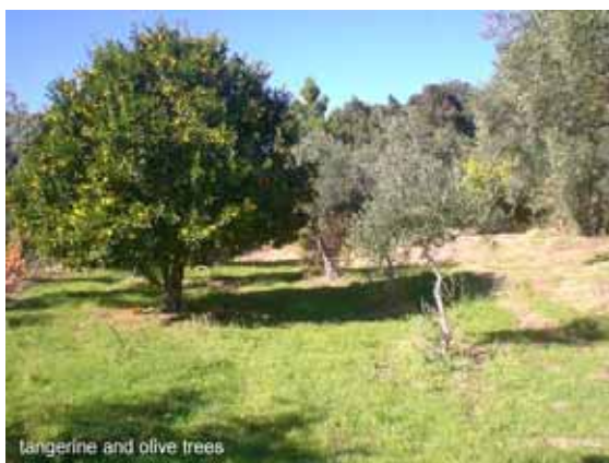
tangerine and olive trees